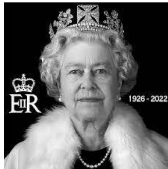
Queen Elizabeth II 1926 – 2022

Mission Northampton - An online course will be starting 13th September between 7.30pm & 9.00pm on the subject – ‘ James - Discerning God's Will ’. The course will run every Wednesday evening for seven weeks. To register your place or for further information please go to: https://northamptondiocese.org/courses/james-discerning-gods-will-autumn-2023/