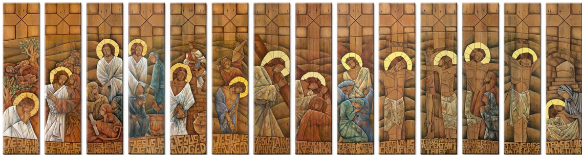
SANCTUS SACRED IMAGES

for the talks will be Thursday 16 th March and Thursday 30 th March . The talks will begin at 7.30pm after 7.00pm Mass. Everyone is welcome!