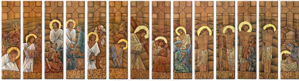
SANCTUS SACRED IMAGES