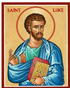
St Luke - Evangelist

The Gathering 2022: Bearing Fruit in Plenty. Saturday 22 nd October 1-5pm Northampton Diocese Women's Ministry Group warmly invite you to an afternoon of sharing, reflection, synodal conversation, worship and prayer at Thornton College, MK17 0HJ. Tea time refreshments provided. There is no charge for this event, but please book on: www.Eventbrite.co.uk/e/416930188417