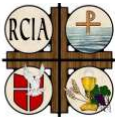
Rite of Christian Initiation for Adults

We begin the month of May which we dedicate to Our Lady. After every Mass, we will either pray the Rosary or say the Litany of Loreto. I would suggest we pray for peace in the world – for the conversion of nations away from war to reconciliation and peace.