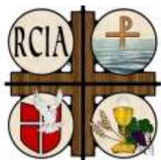
Rite of Christian Initiation for Adults